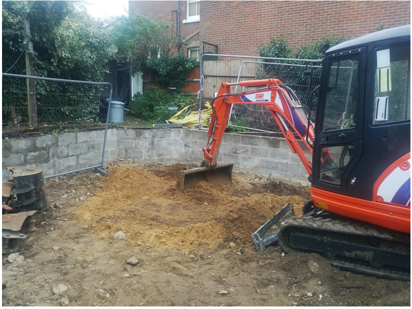
Photograph 1 Working shot, looking southeast

The development site was situated within the footprint of a demolished garage where ground level had previously been lowered/terraced by 0.6-0.8m (presumably when the garage was constructed). As part of the current development, a CAT archaeologist supervised the further ground reduction of an area 7.7m by 5.7m. Approximately 0.12m of modern topsoil (L1, c 0.12m thick, medium/dark brown silty-loam) and 0.1m of natural sand (L2, light/medium yellow/orange/brown sand) was excavated. No new foundations were excavated as the new garage is to be built on a raft.