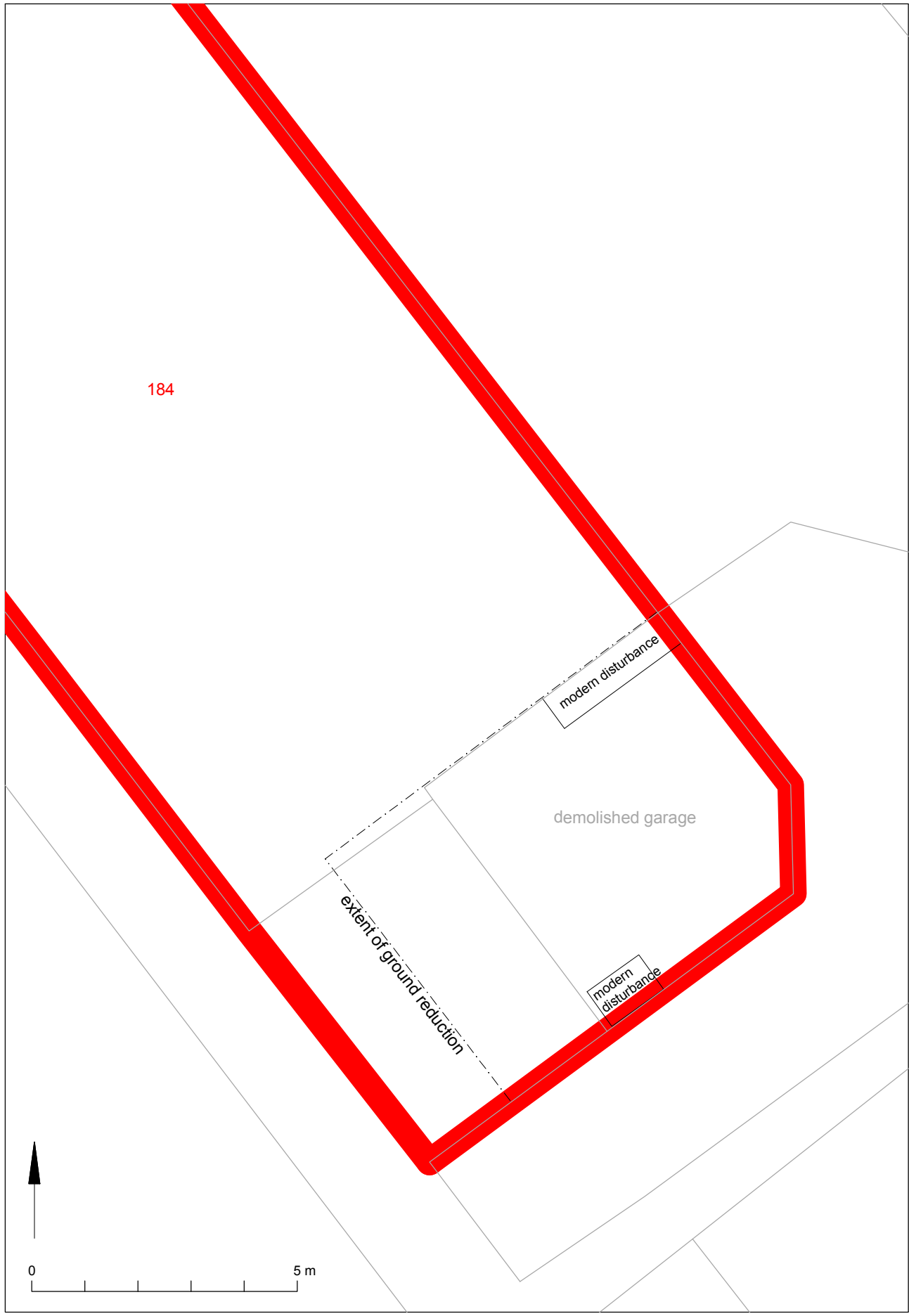
Fig 2 Results