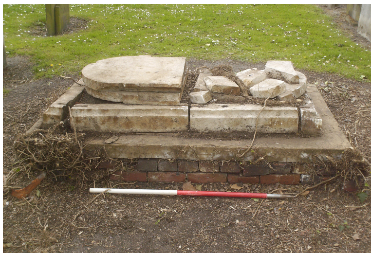
Plate 2 Grave monument F3, viewed from the south.

This monument has since been consolidated and the headstone incorporated into the plinth.