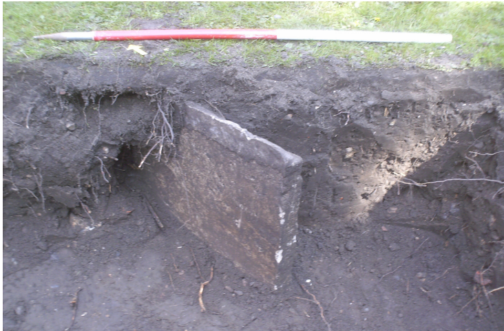
Plate 1 Headstone F1, viewed from the south-west.

inscription present. The headstone was 70 mm thick, and probing in the section indicated that it was 670 mm wide. It extended below the bottom of the trench. The top of the headstone lay only 100 mm below the modern ground-level and part of it was cut away by the contractors prior to concreting. The headstone was presumably set at the western end of a grave, all trace of which above ground has disappeared. It was probably of 19th-century date.