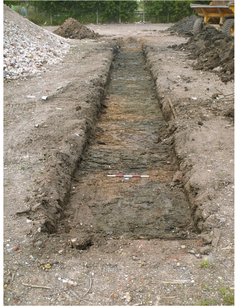
A1.4 Trench 4 facing north