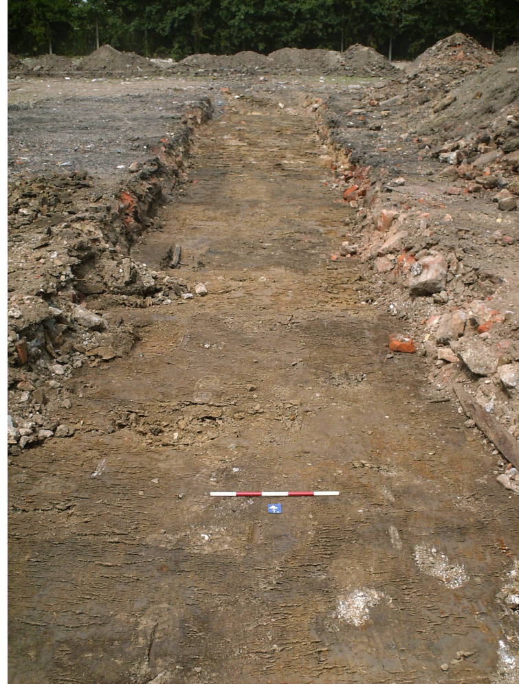
A1.2 Trench 2 facing north.