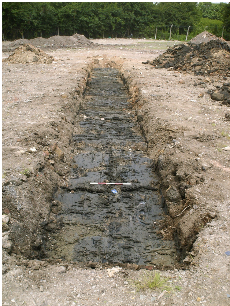
A1.5 Trench 5 facing north-east.