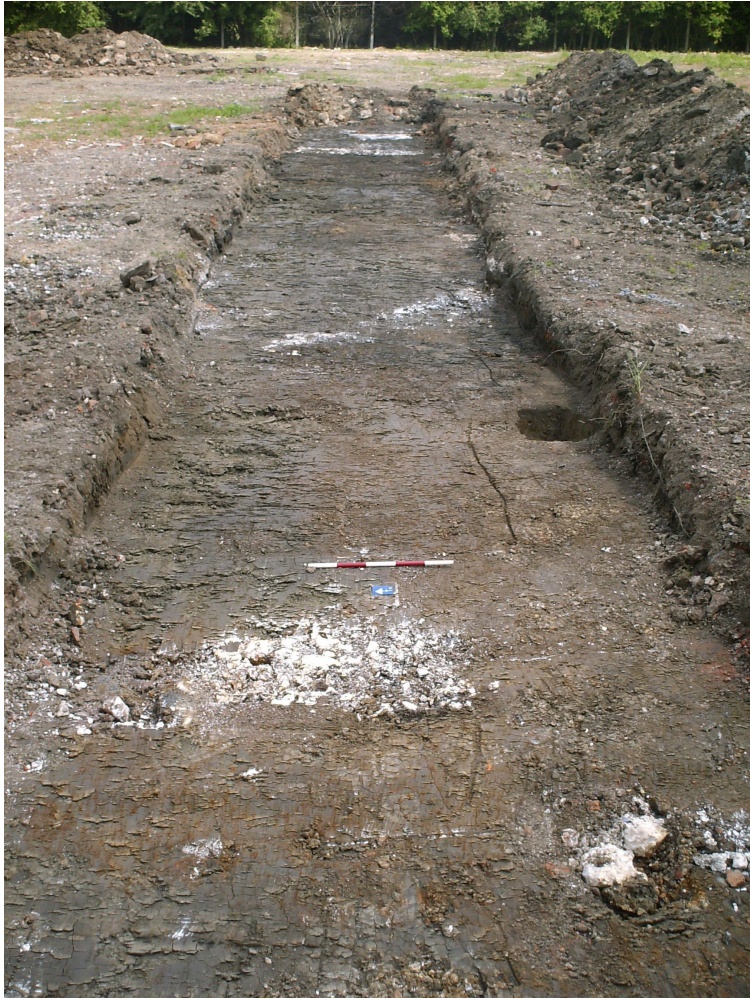
A1.3 Trench 3 facing east