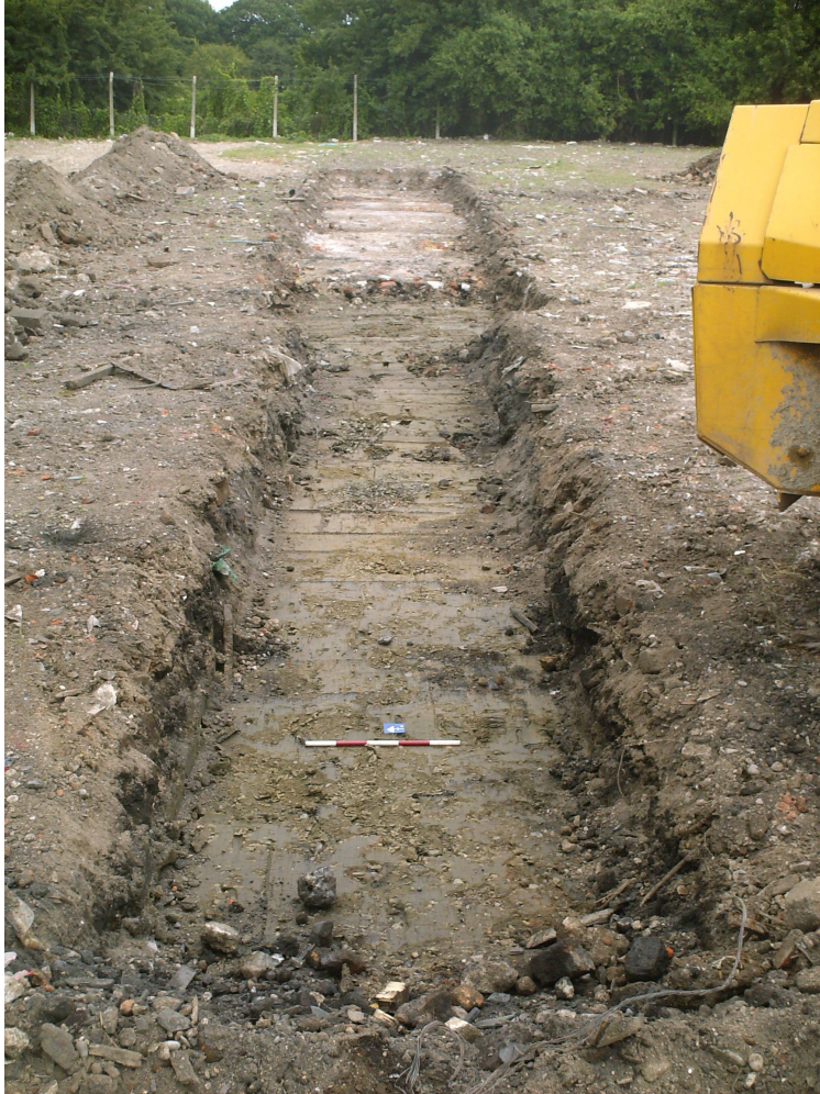
A1.1 Trench 1 facing east.