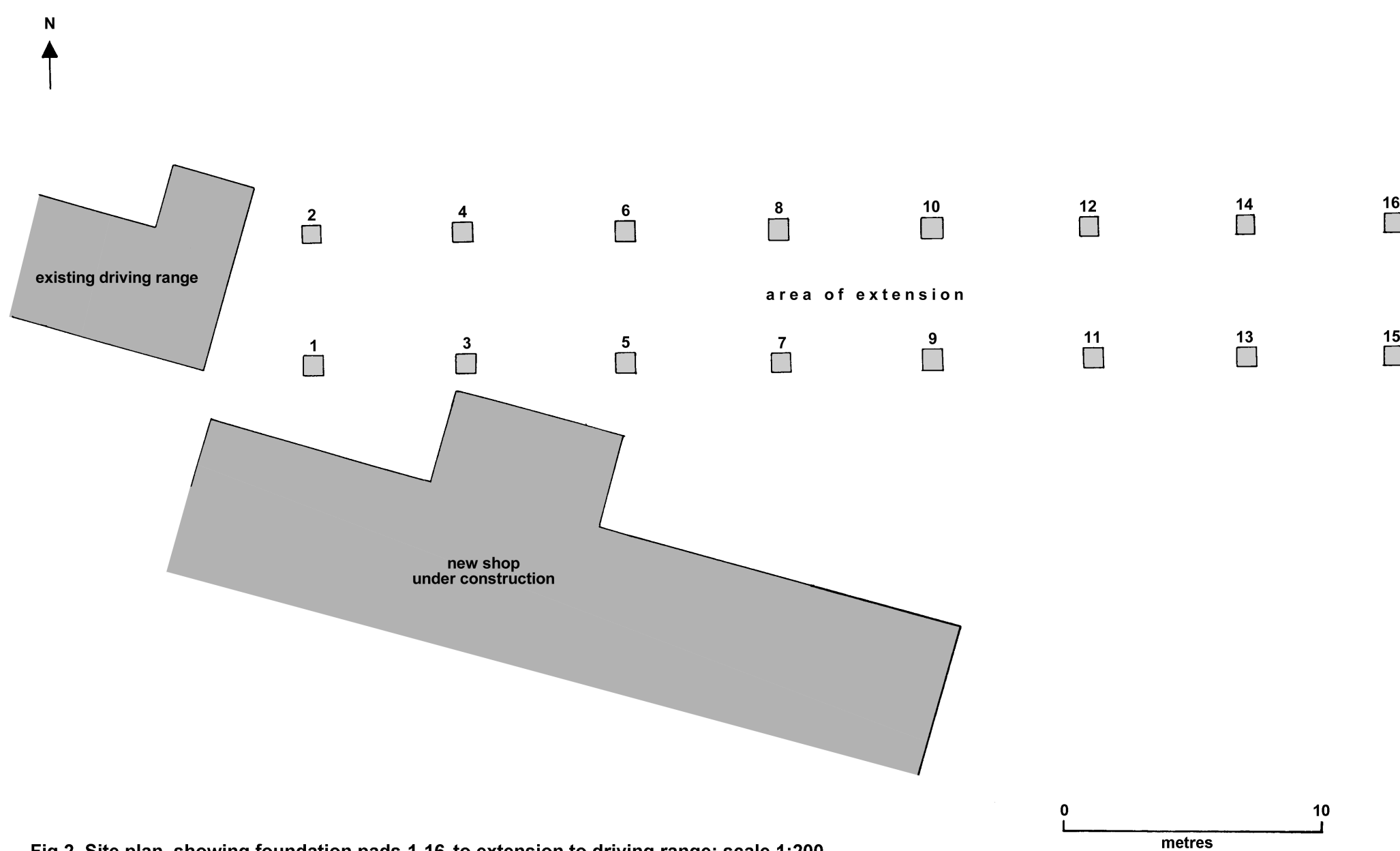
Fig 2 Site plan, showing foundation pads 1-16 to extension to driving range; scale 1:200.